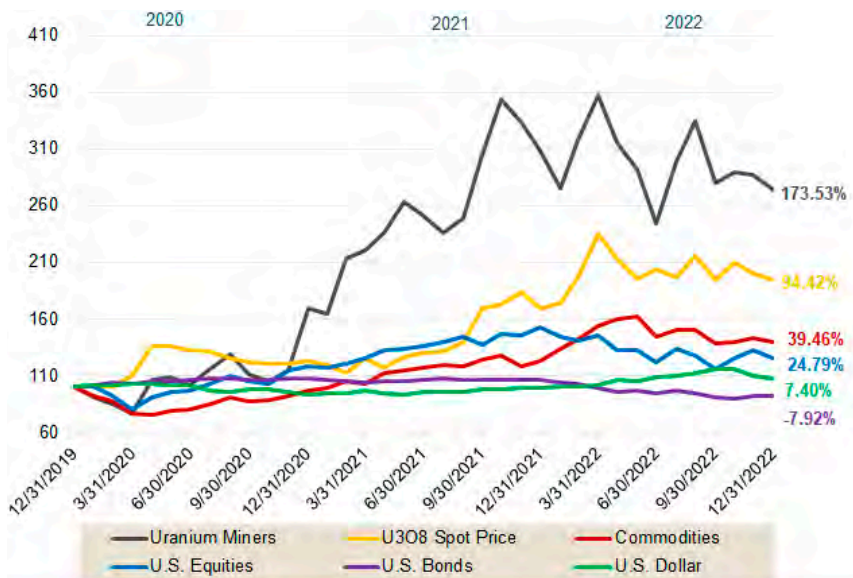
Figure 1. Uranium Outperforms Other Asset Classes in the Short Term (12/31/2019-12/31/2022)

Data as of 12/31/2022. Gold is measured by GOLDS Comdty Spot Price; S&P 500 TR is measured by the SPX; BCOM is the Bloomberg Commodity Index; US Agg Bond Index is measured by the Bloomberg Barclays US Agg Total Return Value Unhedged USD (LBUSTRUU Index); the U.S. Dollar is measured by DXY Curncy and the U3O8 uranium spot price is measured by a proprietary composite of U3O8 spot prices from TradeTech LLC. Included for illustrative purposes only. Past performance is no guarantee of future results.